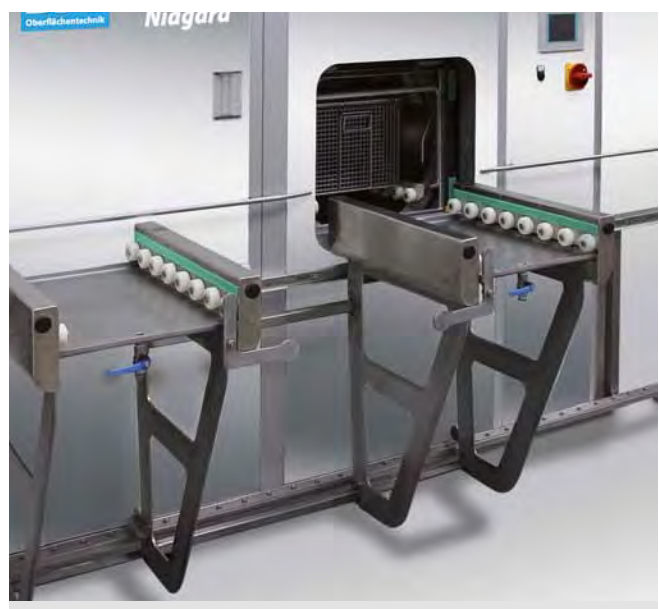
Detail Niagaramo with cross movement table