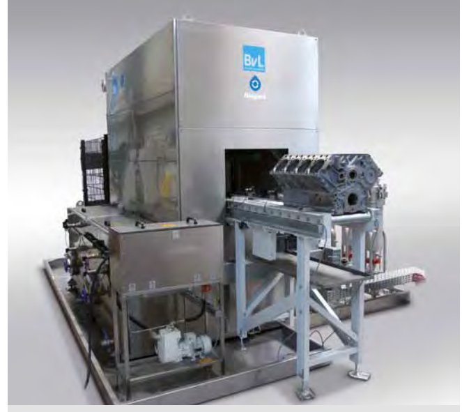
Version: NiagaraDFs with cycled flow-through process for optimising cycle times