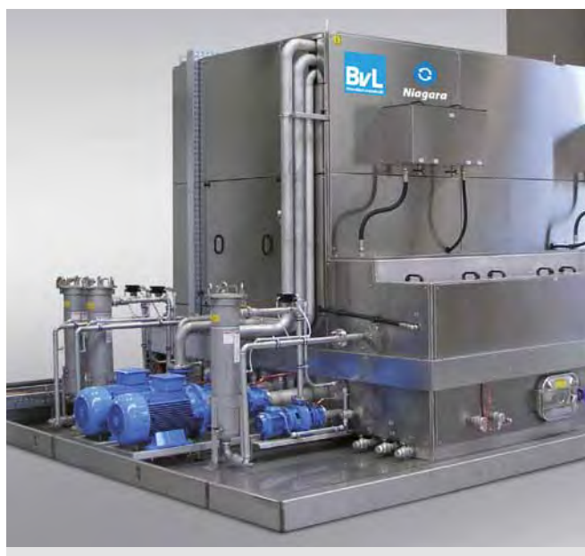
Detail Pumps and filter technology