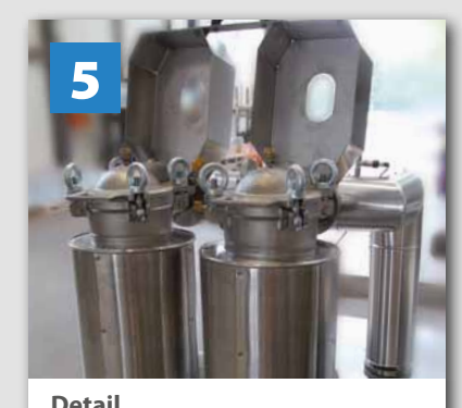
energy saving insulation package