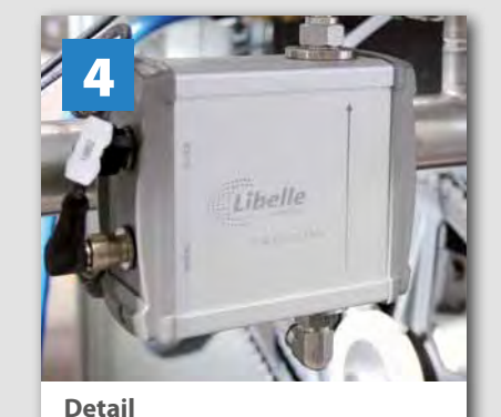
Libelle for bath monitoring