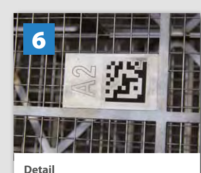
barcode query + storing of washing program