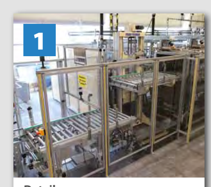
Detail lifting/lowering station

Your requirements are our targets. We use our competence and longstanding experience to determine the ideal combination of technology, cleaning agents, time and temperature for your cleaning process. Our modular systems allows us to benefit from reliable technology while individually customising the system.