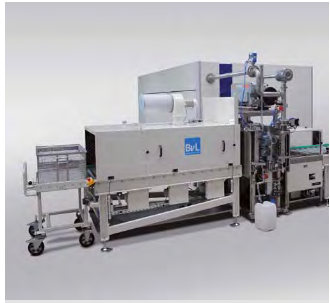
Detail: NiagaraWE with loading carriage, cooling tunnel, external vacuum drying and roller conveyor