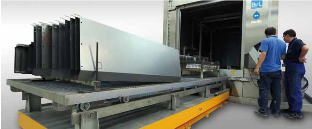
Version PacificTA with scissor lift table and automatic drive in and drive out device