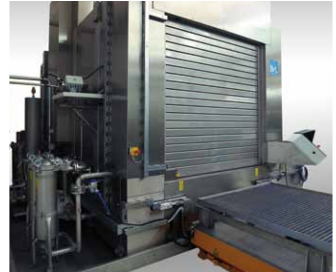
Version PacificTA with rolling gate, filter system and heat exchanger