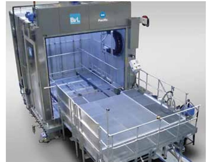
Version PacificTA with pedestal, loading carriage and interior lighting