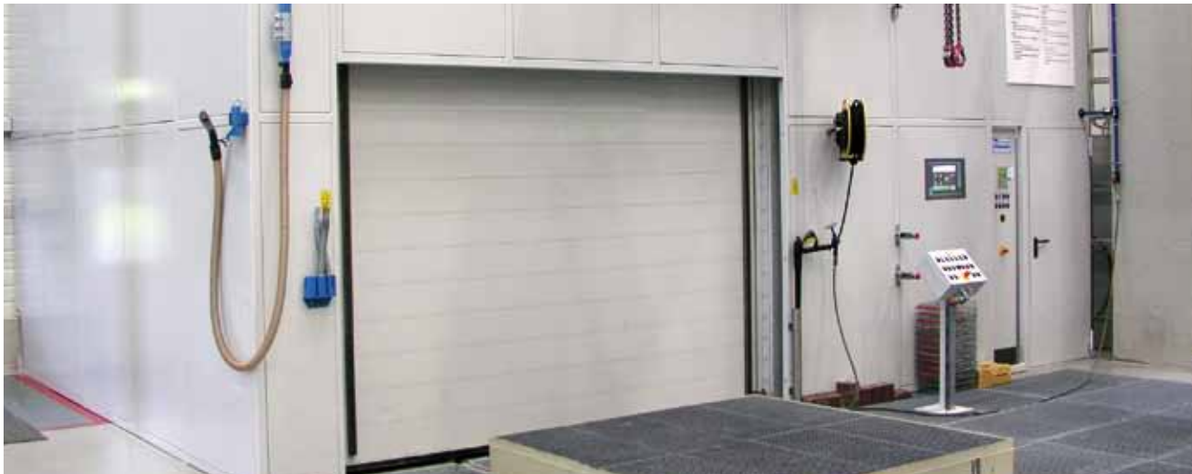
Version Painted full housing, floor level loading, additional manual extraction of residual water from parts with recesses or cavities and Libelle bath monitoring